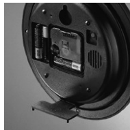
Includes convenient stand for tabletop display